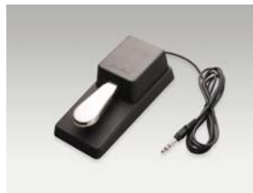
F-10H Damper/Switch Pedal