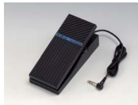
V-20X Expression Pedal

Availability of optional accessories may vary according to market area. Please contact your local KAWAI dealer for details.