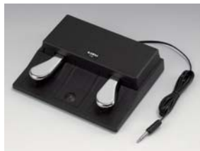
F-20 Double Pedal